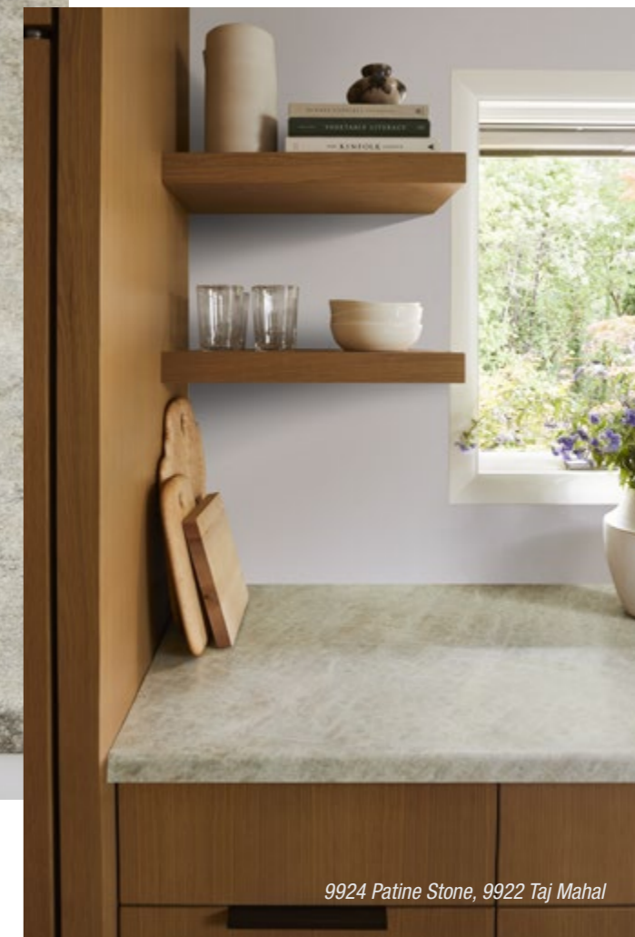
9924 Patine Stone, 9922 Taj Mahal