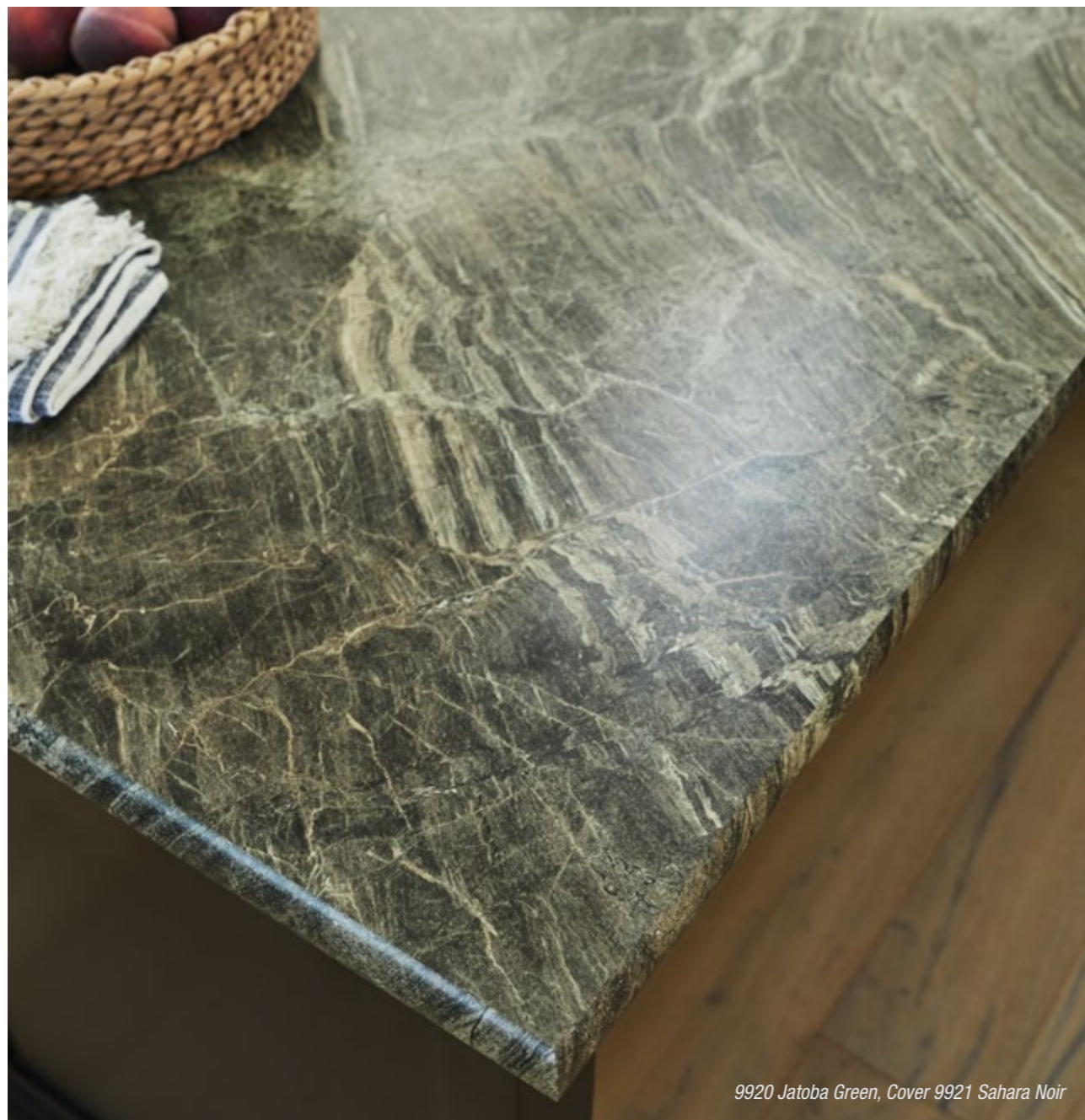
9920 Jatoba Green, Cover 9921 Sahara Noir